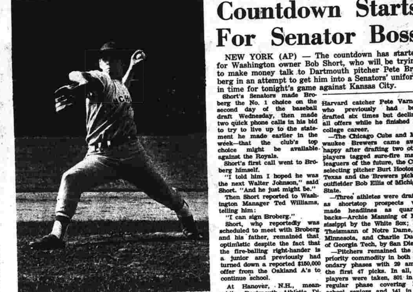
Brad Steurer Gets Set to Release Pitch