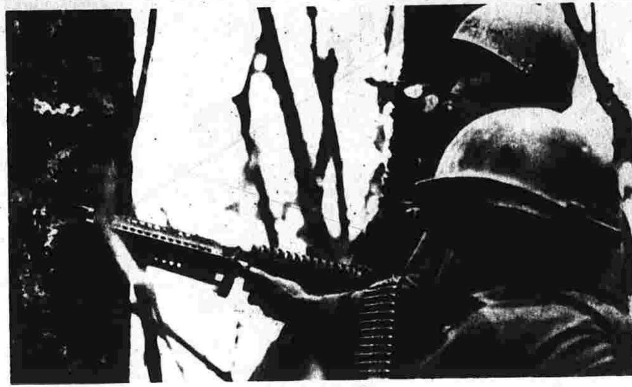
Trees provide cover for South Viet machine-gunner and another soldier during operation against enemy positions in a Shau Valley, part of foe's supply trail. (See story Page One.)