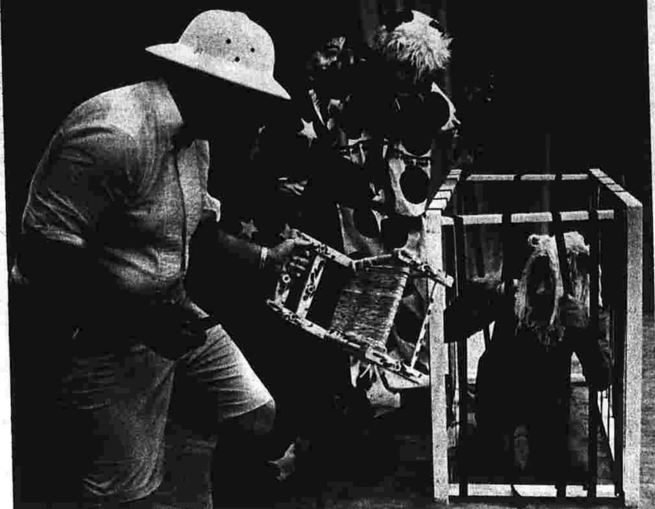
A Roaring Good Time

NEW YORK (AP) — United Parcel Service announced today it had reached a tentative settlement with representatives of three Teamsters locals that have been on strike since May 2.